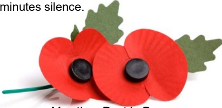
May they Rest in Peace

Remembrance Sunday is this week. The 11am Mass will begin at 10.55 with the National act of Remembrance and two minutes silence.