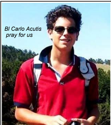
Bi Carlo Acutis pray for us

Priced at £25 and can be pre-ordered at Waterstones, or from other on-line stores. All profits go towards supporting people who are street homeless and in housing crisis. More info at: passage.org.uk/tasteofhome