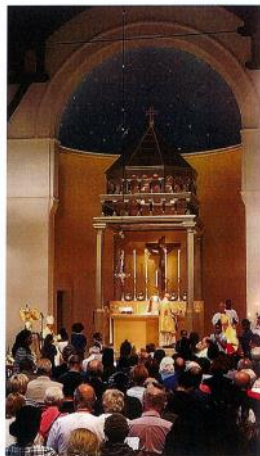
The Ordinariate and Parish Church